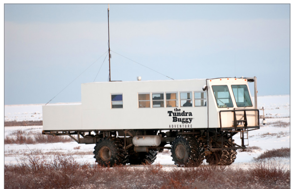
The Tundra Buggy