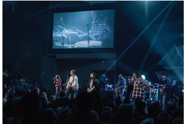
2016 Christmas Eve Services at NewSpring Church

The captions cannot occlude the speaker or the big-screen monitor next to him that displays a verse of scripture as he is referring to it. In some cases, however, the NewSpring Church logo in the lower left corner of the TV screen animates in a way that brings text of scripture on-screen as a lower third super. Hoover adds this text in postproduction while editing in Premiere.